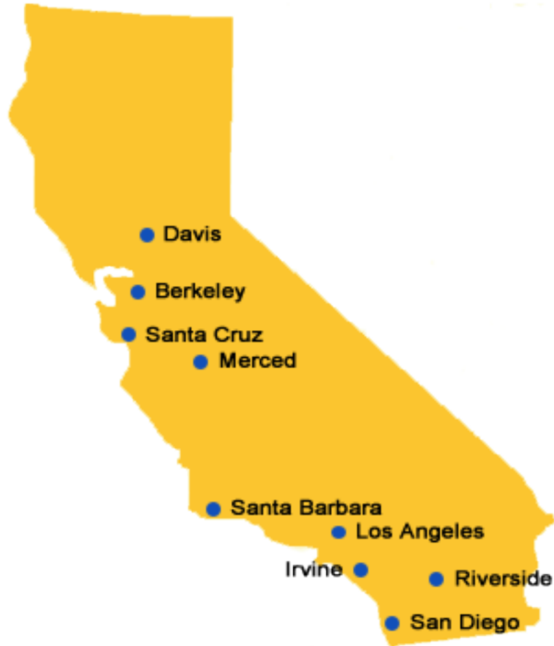
The 9 universities of the University of California (UC) system